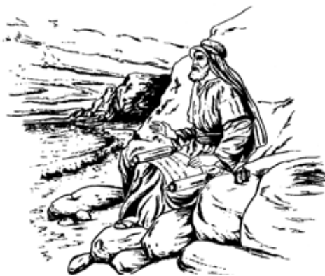
Juan, Patmos-dupgi odurdaklesii, negburgan-daksad. (Burbar-Oyolesad 1:9-11)

“Mer doogu, ani an Gebesailaginedid, ani an Napisoladbalid.