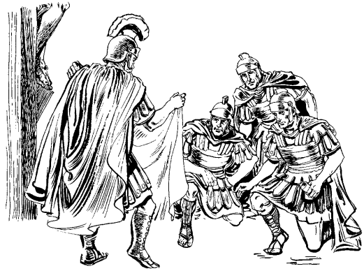
Suar-ibgan dodoar wilubdaknai-guarmalad, Jesús-mor-igid na emargadga guodibeye. (Marcos 15:24)

Jesús'ba-nakrusgi-bioklegar-naimarmogad egi dodonanai gusmarmogad.