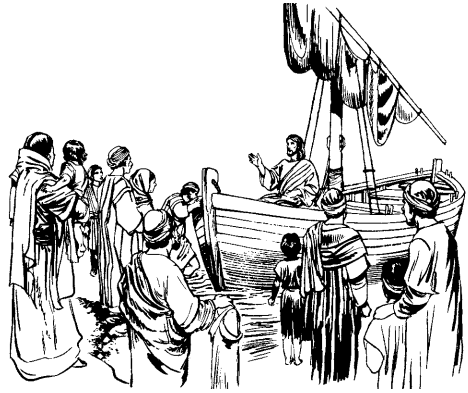
Jesús urgi-sii, ibmar-burbamaladgi dulemar-odurdakded. (Marcos 4:1)

Ega sogded: 3 “Bemar nue itomar: Ibagwengine, dule-wargwen-ibmar-gwag-digedi ibmar-gwag dignaded. 4 Digega ibmar-gwag-bikin-midgua, abar ibmar-gwag igargi babatidapid. Sikwimar nonigua, a-ibmar-gwag guchad. 5 Abar akwa-yaisulidgi, napa-asginegwadgi babatimalad. Agi gwae-gwae ibmar-gwag ainialid, ar ade, napa-asginegwad. 6 Ar dad gaargudii, ibmar-gwag gummakded, ar e-maligan asgin-nikasoggu, dinguded. 7 Baid-ibmar-gwag iko-abargi babatisad. Ikomar dungudgua, bur bule ibmar-gwag-birgi obited, degisoggu, ibmar-gwag gwen sanmaksasulid. 8 Bamalad-ibmar-gwagdi, napa-nuedgi babatisad. Ainided, dunguded, geb nue sanmaksad. Gwenna-gwenna akusaar sanmaksad, abala bur-nuegwad sanmaksad, baigandi bur bule sanmaksad.”