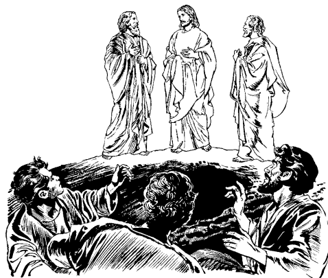
Yarbirgi, Pedro, Santiago, Juan, Jesús-e-san-dakleged-gwagsa daksad. Amarde, Moisés, degi, Elías, Jesús'mala sunmakgwichi daksabalid. (Marcos 9:2-4)

Deginbali, Garda-Narmaked-Dulemar e-sapingan-bamalad-ebo abin-abin-imaknanaidaknonibalid. 15 Dulemar Jesús-nonikid-dakarmargua, geger dakdemalad. Geb Jesús'ga be-dog-nued-sogeye-sogega ese duurmakarmalad. 16 Jesús e-sapinganse egichisided: