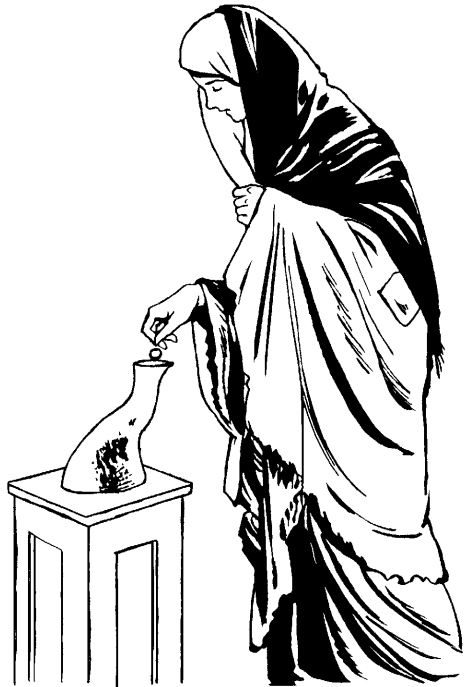
Ome-ei-sui-burgwisad-wileged Bab-Dummadga-e-mani-esnon- gwabo-uksad. (Marcos 12:42)

43 Geb Jesús na e-sapinganse gochad, ega sogded: “Napira an bemarga soged, we-ome- ei-sui-burgwisad-wileged bur bule ulu-yagi dule-baiganba mani-egwachad. 44 Ar dule- baigandi, mani-ei-gwabgusad egwachamalad. Ar we-omedi, na e-wilesagwadgine bela-mani-nika- gudiid egwachad. We-maniginbi gudiinad.”