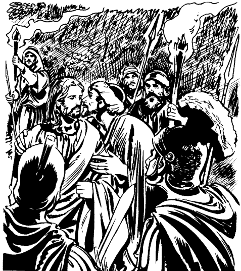
Judas, Jesús-wagar-usadba, darba Jesús-uksad. (Marcos 14:45)

—¿Ibiga dule-ibmar-atursaedyob es-suidyalaba, degi, suarmaryalaba be an-gadanimala? 49 Bane-bane an bemar-abargi gudigusad. Bab-Dummadse-goled-neggi, an dulemar-odurdakdii gusad, degite, gwen be an-gassurmalad. Degi-inigwele, ar Bab-Dummad-Gardagi-narmakar-naidba ibmar guergebed.