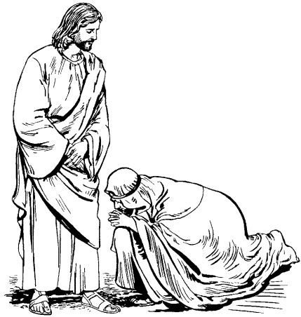
Jairo, Jesús'se wilenaigusad, ega e-bunalo-nudakega. (Marcos 5:22-23)

37 Jesús, dule-bamalad eba-naed imaksasulid. Unnila Pedro, Jacobo, degi, Jacobo-urba-Juan, amarbi eba-naed imaksad.