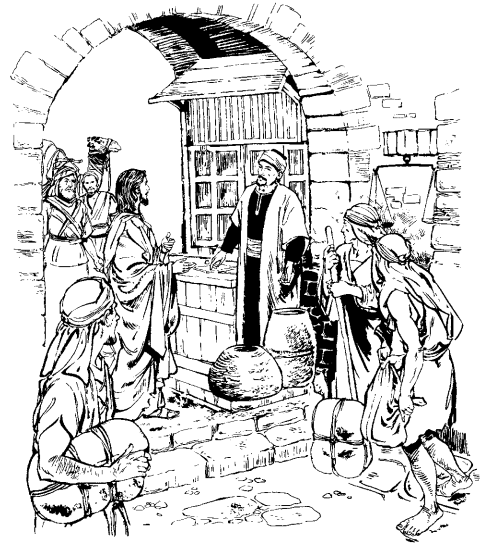
Jesús, Roma-dummadga-mani-galedged-neggi Mateo'se (Leví) gochad eba naegar. (Marcos 2:14)

—Juan-sapingan, degi, Fariseo'mar-sapingan, Bab-Dummadse-golega mas-gunsuli gudimalad. ¿Ibiga be-sapingandi, Bab-Dummadse-golega mas-gunsuli geg-gudii gue?