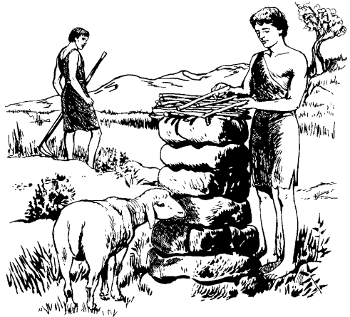
Bab-Jehová, Abel-ega-ibmar-uksad yeer daksad, degi, Cain-ega-ibmar-uksad abingassulid. (Génesis 4:4-5)

—An wissuli. ¿Ar ande an-urba-edarbedsi?