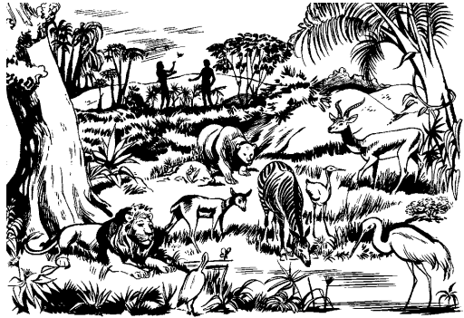
Bab-Dummad dakded, bela ibmar-na-obinnisadi, bela-bela nueganbi. (Génesis 1:31)

9 Agine, Bab-Dummad-Jehová sapimar akar-akar bela yeerdaklemalad ainiega imaksad. A-sapimar-e-san bela yeer-gulle imaksad.