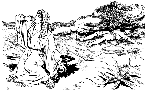
Agar sindigar-siid. E-machi-Ismael'di bannabaa mellemaid. (Génesis 21:15-16)

15 Buglugi dii-siid bergusgu, Agar sapi-urba e-machi sisad. 16 Agar'di bannabasaar wilubba-banguedgi signaded. Ar ade, binsasad: “Machi burgwialir, an dakbisulid.” Agar sigidapgu, machi boalid.