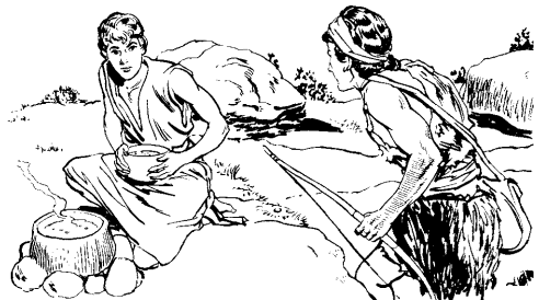
Esaú, machi-sailagined-guedgi-ibmar-uklegoed baisur daksad. Esaú, ukudmaada-nonigu, e-urba-Jacob ega ingwa-dualed uksad. (Génesis 25:34)

Weyob, Esaú na machi-sailagined-guedgi bela-ega-ibmar-uklegoedi, baisur-daksad.