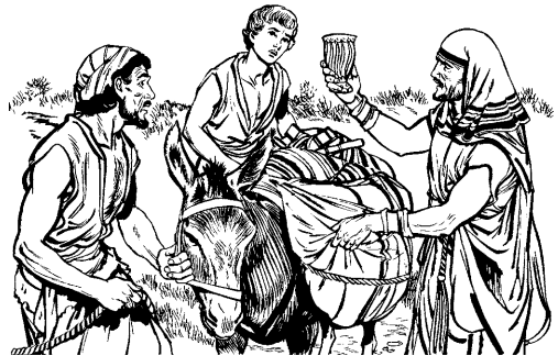
José'ga-neg-akwed, Benjamín-sagu-yaba nog amisad. (Génesis 44:12)

—¿Ar igi anmar be-abin-imakosunna? ¿Ar igi anmar sogosunna, anmar deyob ibmar imaksasurys? Ar Bab-Dummadde anmar-daksad, anmar nue-dummad nosad. Degisoggu, wegi anmar, degi, dule-sagu-yaba be-nog-amilesad, be-maiga gumarsunnodo.