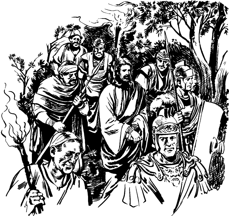
( Mateus 26.47 )

47 Jesus egidaageeteda me dotaga nigicotalo Judas, nigijo ane-diotibece Jesus, lokaagetedipi nigijo anodiotibece. Odaa Judas lixigagawepodi ijo noiigi-nelegi onadeegi nodaajoli-ocagatedi inaa laxacogonagatedi. Nigijo anoiige sacerdotitedi ijaagijoa laxokodi lacilodi judeutedi joanegepaagoimonya nigijo noiigi-nelegi. 48 Nigijo ane yajigo Jesus akaa dinilakidetege nigica anodaagee me ikee ane digetedigi Jesus. Meetiogi, “Nigica ane inapicogo me idecoaditece, jigidaagidoa nigijoa goneleegiwa anoleetibigetiwaji. Odaaganiwiloteda!” 49 Nigijo Judas nigicotiogi, ja dowicetelogo Jesus, odaa meetalo, “Ele gocidi, iniigaxinogodi?” Odaa ja napicogo. 50 Naga ninigodi Jesus, meeteta, “Yokaagedi, ageniteloco nigica ane gabakedi managi!” Odaa jogototelogo Jesus, jogodibatalo moniwilo. 51 Pida anigepidigica nigijo anodiotibece nixigitice