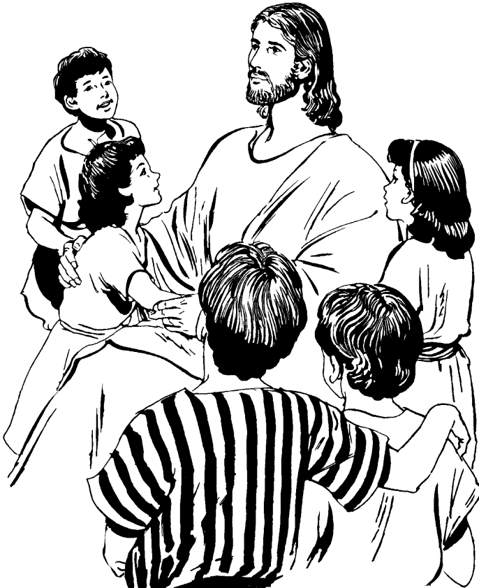
( Mateus 18.2 )

18 1 Jesus egidaageeteda me yotaganega Pedro, odaa nigijo anodiotibece jigigotibeci midoataga, odaa jogoige, moditalo, “Amiina ica oko ane gonegegi ina naga iige Aneotedogoji laalegenali ina oko?” 2 Odaa Jesus jegenidite ijo nigaanigawaanigi, jigideyate liwigotigi nigijo anodiotibece. 3 Odaa meetediogi, “Ejitagawatiwaji anewi. Nige daga iigitiwaji aneni me gadewiki, codaa nige dagadiniwikodenitibece micataga nigini nigaanigawaanigi, Aneotedogoji aiige gadaalegenaliwaji, odaa agica