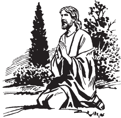
Mateo 26.36-46; Lucas 22.39-46

46 ¡Pet txakpoj ex! ¡Ko'naj! Tan il u naj ile' tul ve'te' uve' tuk aq'on ok in tiq'ab' unq'a aapaave',— ti'k u Jesús.