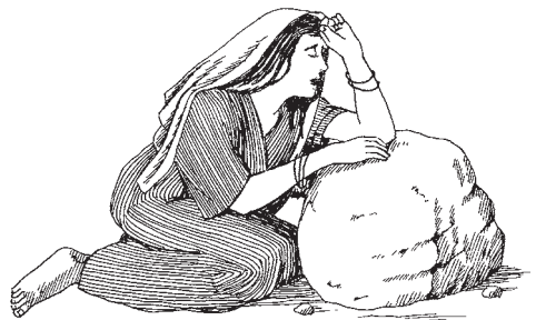
Miet puṣṣu kek kɔc mit puṣṣh, ku dhīaaukē ke kɔc dhīau (12:15)

14 Rōṣkkē Nhialic rin b̄i yen kɔc jōr we dɔc, ku duṣṣkkē rōṣk tēnē ye rin b̄i yen ke tēm awuṣc. 15 Miet puṣṣu kek kɔc kōk mit puṣṣh, ku dhīaaukē kek kɔc dhīau. 16 Calkē ʔer piāndun athōŋ tēnē kɔc ēbēn. Duṣṣkkē nhīam, dhuṣṣkkē rōt piny ku luṣṣikē tēnē kɔc kor tēnē we. Ku duṣṣkkē ye tak lɔn ē wek ŋic kāŋ.